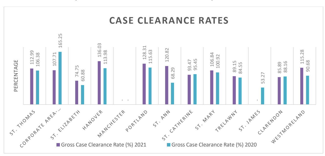
Chart 2.0b: Comparison of case clearance rates across the parish courts for 2020 and 2021