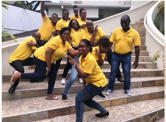
Team members of the Human Resource Management and Administration did not only brighten the place with their yellow but also with their electrifying energy like the sun.