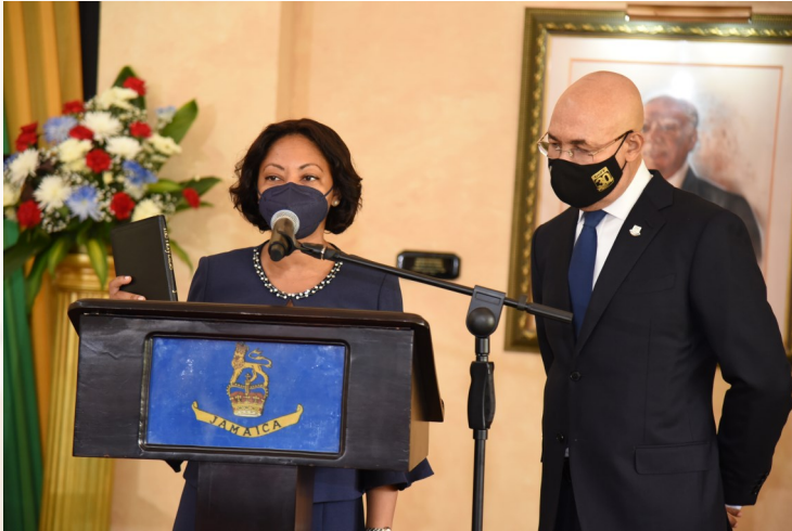
PHOTO HIGHLIGHTS - SWEARING-IN CEREMONY