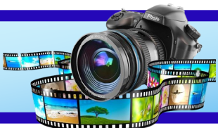
PHOTO HIGHLIGHTS CAD STRATEGIC RETREAT Pages 16-20

The newly established Family and Probate Division hears matters in relation to divorce, division of property, child custody and maintenance.