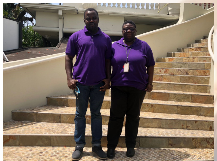
Members of the Building and Planning Division at Court Administration Division on Day Three of the Strategic Retreat held at the Terra Nova All-Suite Hotel.