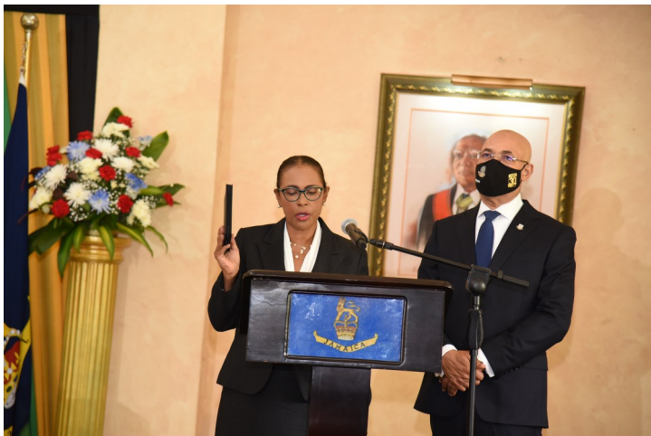
PHOTO HIGHLIGHTS - SWEARING-IN CEREMONY