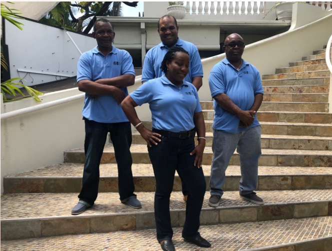
Team members of the Internal Audit Division at the Court Administration Division holding a vibes at the Strategic Retreat.