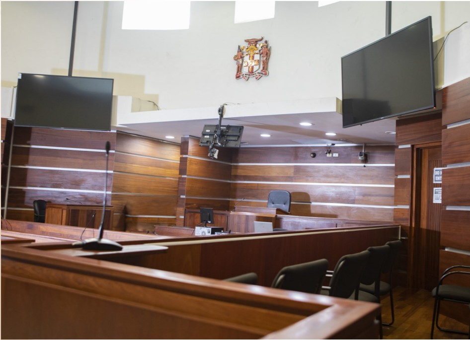
File Photo: Jury box in Courtroom #14 at the Supreme Court in downtown, Kingston.

The Judiciary's COVID-19 Advisory Committee, chaired by Chief Justice the Honourable Mr Justice Bryan Sykes and stakeholders from across the justice sector, said the suspension of jury trials will remain in effect due to the spike in COVID-19 cases and the inability of the courts to facilitate the recommended physical distancing.