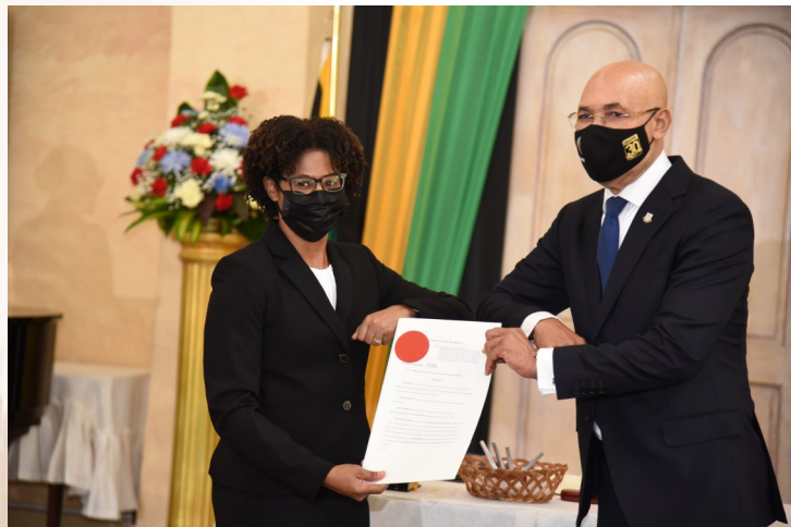
PHOTO HIGHLIGHTS - SWEARING-IN CEREMONY