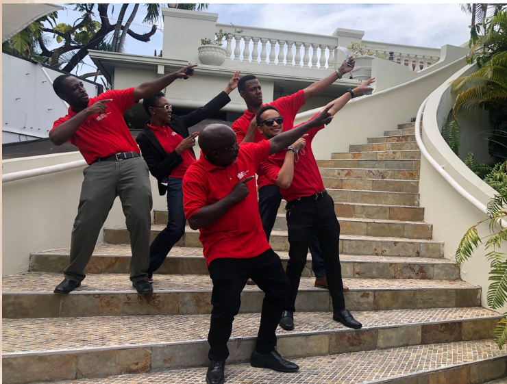
Members of the Information, Technology and Communications Division showing us that they are more than computer geeks at the Strategic Retreat. They are socialites.